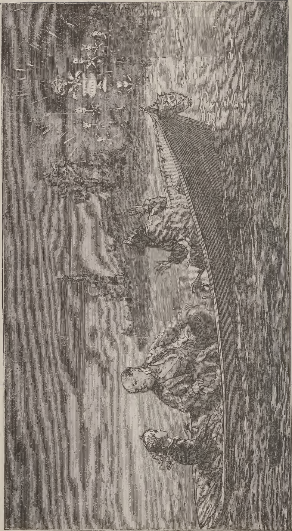
“THAT WAS RATHER A NEAT THING, I FLATTER MYSELF,” SAID UNCLE MAC. — Page 117.